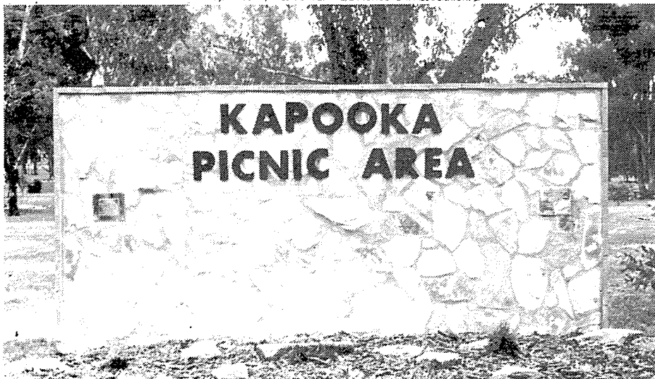
Wall of Remembrance, Kapooka Camp. Plaque on left has following inscription: "Presented by members of 2/1-2/2 Pioneer Btns Assoc. on the 40th Anniversary of the reformed 2/2 Pioneer Btn who occupied this campsite from July to October 1942." The warm welcome and farewell of the 1942 Mayor and citizens will always be remembered – 19th September 1982."