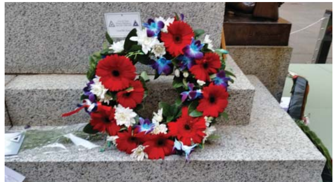
The Wreath that was laid on the Cenotaph on 24th April, 2016 for the 2/1st and 2/2nd Battalions