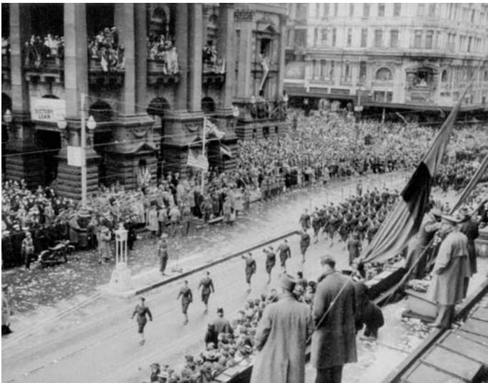
Photo: Melbourne 1945 VIP Day AWM Vic1682.