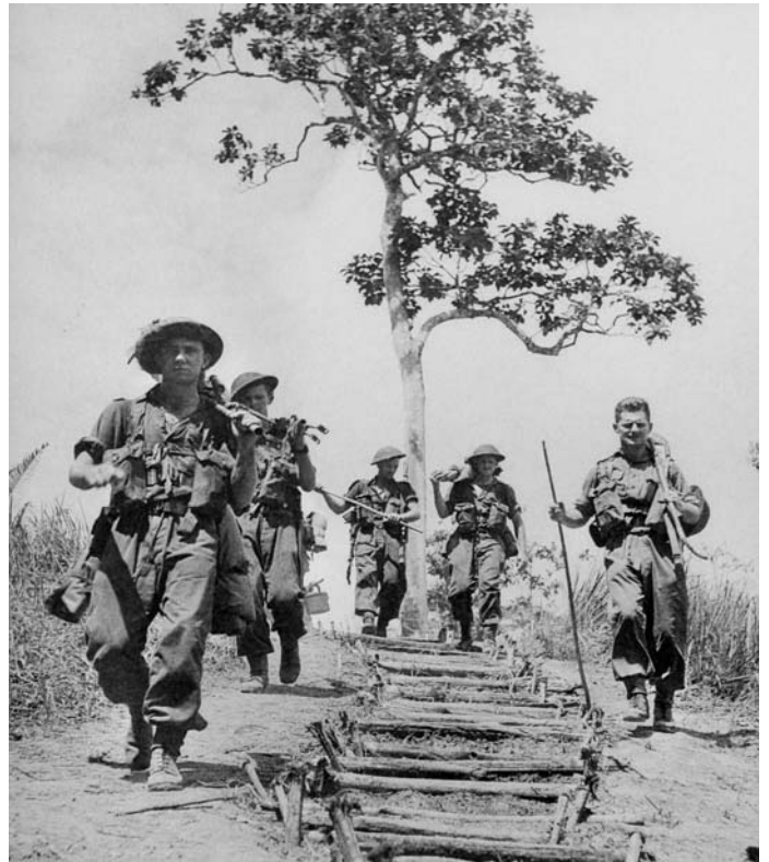
Australian Infantry Battalion on Owen Stanley Ranges near Nauroi and Menari.

Certificate of Appreciation - Presented by His Excellency General, The Hon David Hurley AC, DSC (Rtd) Governor of NSW